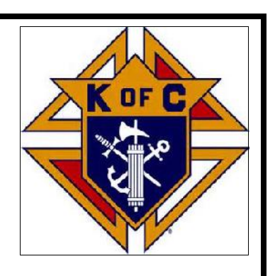
K of C Hall 3310 Florida Ave. Kenner, La. 70065

Food and drinks served starting at 6:00 pm.